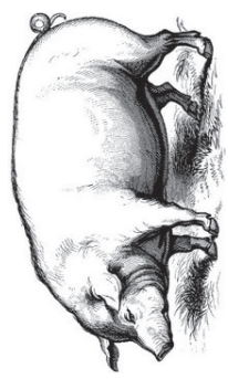
Enter all Crossbred Barrows as Class HM, Lot 90